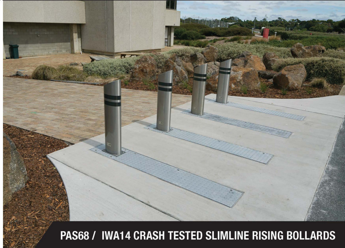
PAS68 / IWA14 CRASH TESTED SLIMLINE RISING BOLLARDS