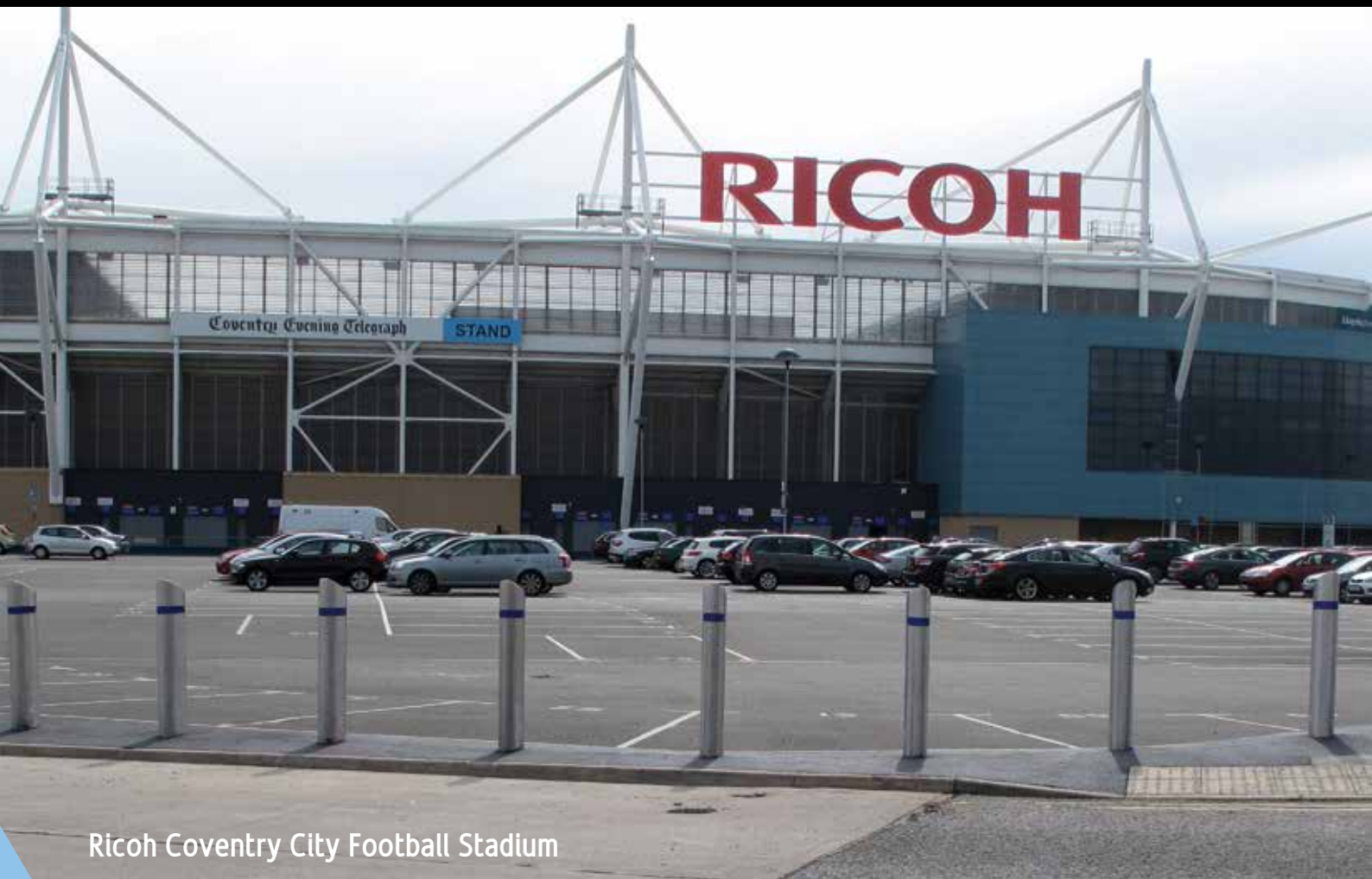
Ricoh Coventry City Football Stadium

Supplier of anti-terrorist bollards (Olympic venues) to the London 2012 Games