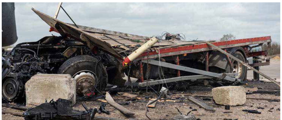
TRUCKSTOPPER 9-50 IWA14:2013 VEHICLE PERFORMANCE CLASSIFICATION